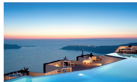
BEDROOMS: 2 SLEEPS: 4 The Villa at Grace Santorini, Santorini