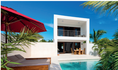
BEDROOMS: 1 SLEEPS: 2 Gardenia Lodge, Turks & Caicos