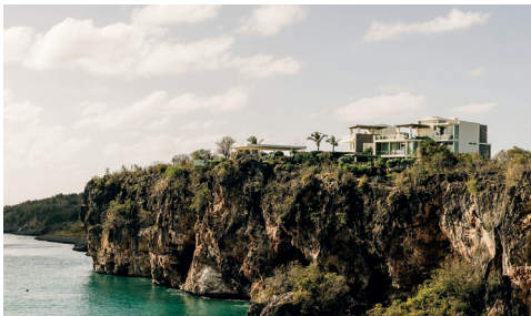
BEDROOMS: 10 SLEEPS: 20 The Gallery, Anguilla