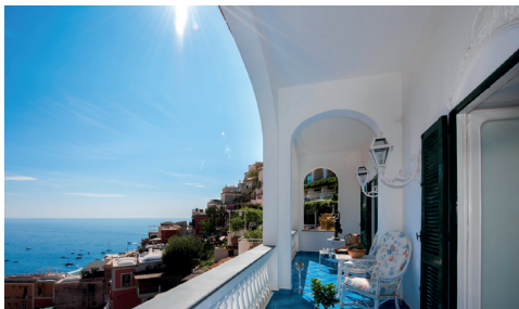
BEDROOMS: 6 SLEEPS: 12 Casa degli Agrumi, Amalfi Coast