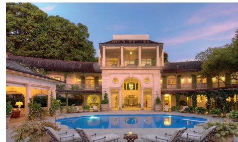
BEDROOMS: 12 SLEEPS: 24 Sandy Lane Estate, Barbados

A quiet villa with access to all the facilities of a luxury resort is the ideal choice for clients seeking a stress-free holiday in the sun