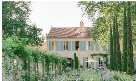
BEDROOMS: 9 SLEEPS: 18 Mas Royal, Provence