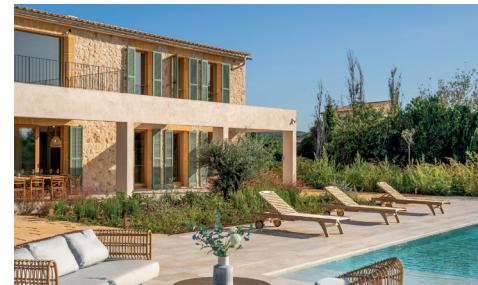
BEDROOMS: 5 SLEEPS: 10 Villa Can Tierra, Majorca