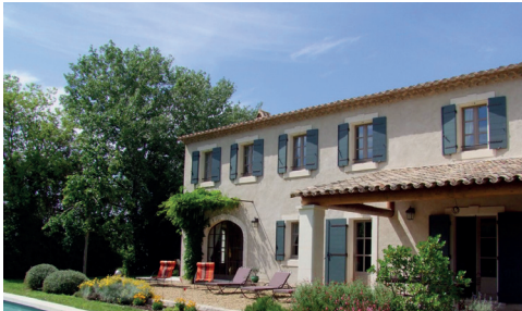
BEDROOMS: 4 SLEEPS: 8 La Mignonne, Provence