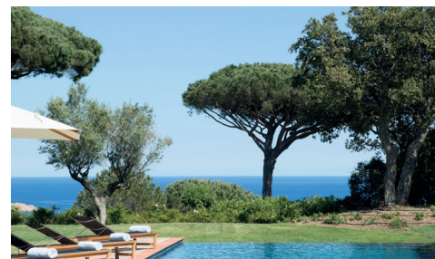
BEDROOMS: 5 SLEEPS: 10 Villa Dahlia, Côte d'Azur