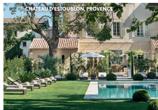
CHATEAU D'ESTOUBLON, PROVENCE