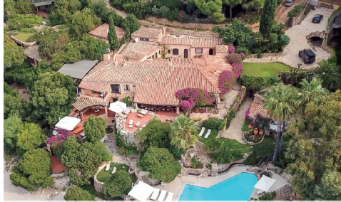
BEDROOMS: 8 SLEEPS: 16 Villa Dieci Stelle, Sardinia

From the sun-drenched Côte d'Azur to the hidden coves of Majorca, these luxury coastal villas enjoy a privileged location close to some of the world's best beaches