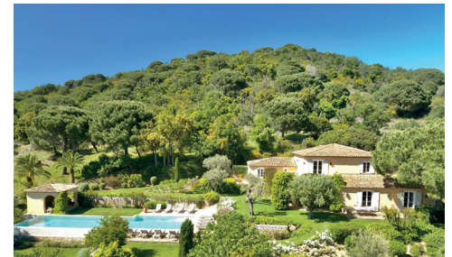
BEDROOMS: 7 SLEEPS: 14 Villa Ramatuelle, Côte d'Azur