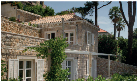
BEDROOMS: 7 SLEEPS: 10+4 Dalmatian Dream, Dubrovnik