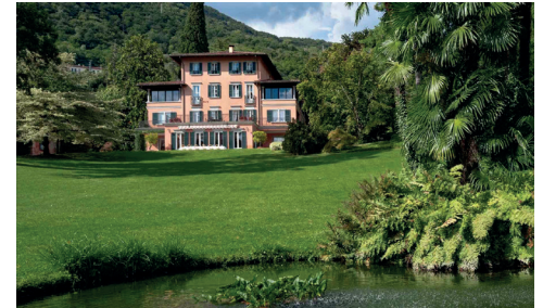
BEDROOMS: 8 SLEEPS: 16+2 La Marchesa, Lake Como