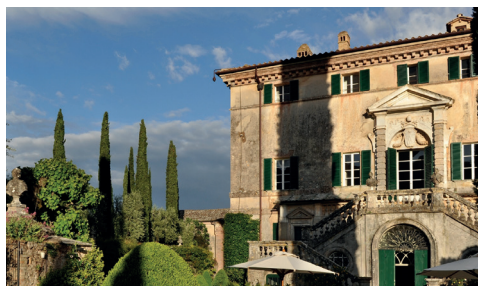
BEDROOMS: 12 SLEEPS: 23+4 Villa Cetinale, Tuscany