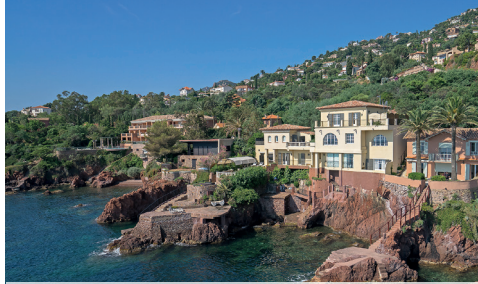
BEDROOMS: 5 SLEEPS: 10 Villa Neptune, Côte d'Azur