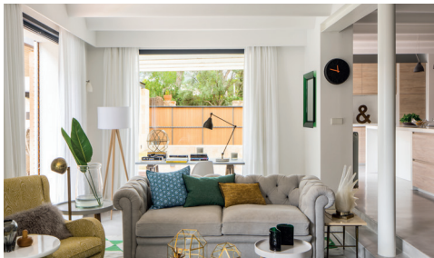
BEDROOMS: 5 SLEEPS: 8+6 Villa Estila, Majorca