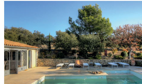
BEDROOMS: 5 SLEEPS: 10 La Borie, Provence