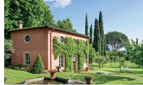
BEDROOMS: 8 SLEEPS: 16 La Limonaia, Tuscany