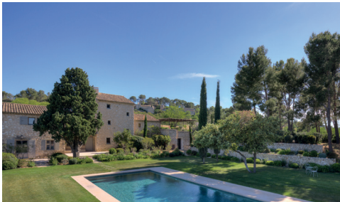
BEDROOMS: 9 SLEEPS: 16+2 Le Mas d'Elise, Provence