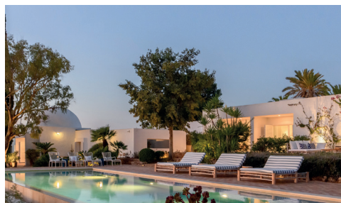
BEDROOMS: 6 SLEEPS: 10+2 Villa Destiny, Algarve