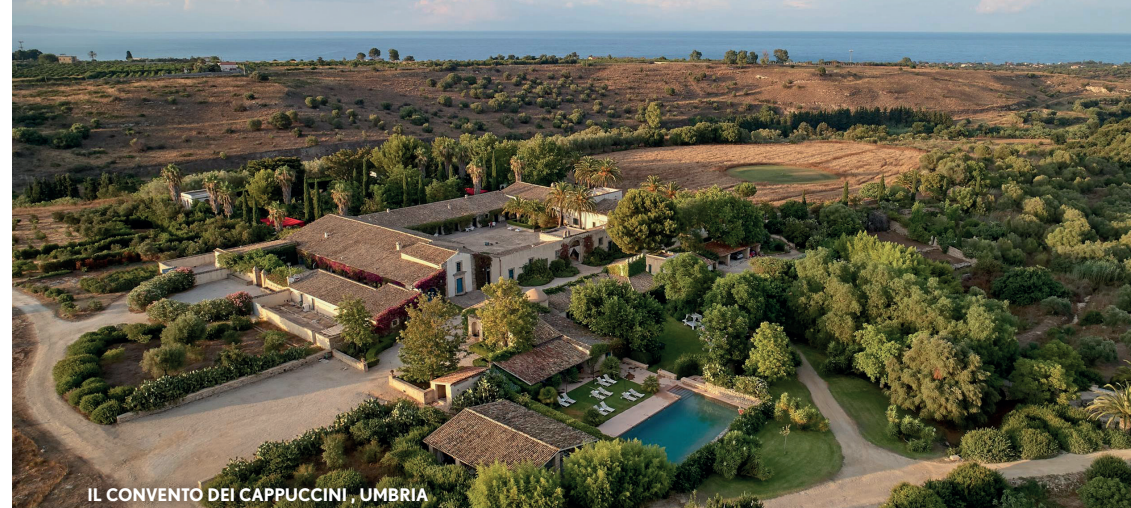
IL CONVENTO DEI CAPPUCCINI, UMBRIA

Are they wine enthusiasts? Amateur historians? Lovers of the great outdoors? Your client's interests will help guide you to their perfect property. It can also influence the extras they're interested in arranging with us, such as guided tours and tastings.