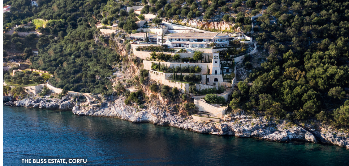
THE BLISS ESTATE, CORFU