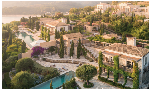
BEDROOMS: 8 SLEEPS: 16 Aguarhea Estate, Corfu