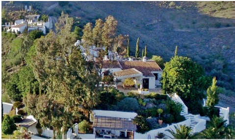
BEDROOMS: 7 SLEEPS: 14 La Maroma Estate, Andalucia

Whether it's for a celebration with a long guest list, or a break for the whole family, our portfolio of large luxury villas ticks all the boxes