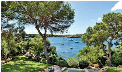
BEDROOMS: 5 SLEEPS: 10 Villa la Silda, Majorca