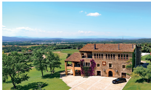
BEDROOMS: 16 SLEEPS: 18+17 Mas Mateu, Catalonia

These luxury properties are sure to please clients looking for the benefits of hotel service with the peace and privacy of a villa holiday