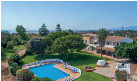
BEDROOMS: 6 SLEEPS: 12 Quinta da Alegria, Portugal