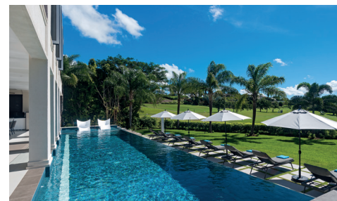
BEDROOMS: 5 SLEEPS: 10 Villa Turquoise, Barbados