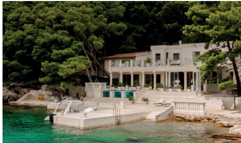
BEDROOMS: 4 SLEEPS: 8 Villa Meleda, Croatia