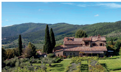
BEDROOMS: 10 SLEEPS: 20+2 Il Convento dei Cappuccini, Umbria