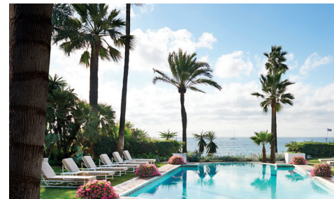
BEDROOMS: 6 SLEEPS: 12 Villa del Mar, Andalusia