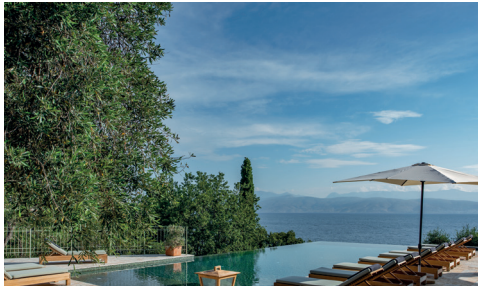
BEDROOMS: 8 SLEEPS: 16 Soukia Cove, Corfu