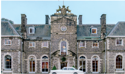
BEDROOMS: 11 SLEEPS: 21 Farleigh Wallop, England