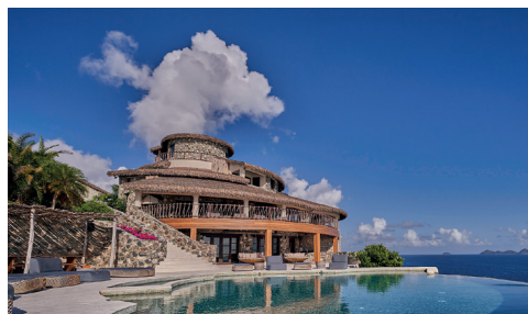
BEDROOMS: 13 SLEEPS: 26 The Aerial, BVI