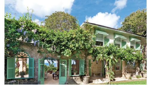
BEDROOMS: 7 SLEEPS: 14 The Messel Estate, Barbados