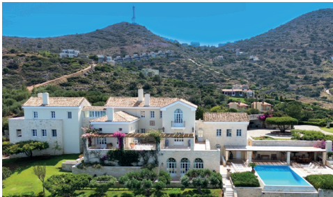
BEDROOMS: 8 SLEEPS: 12+4 Simeroma, Crete