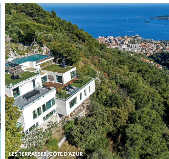
LES TERRASSES, CÔTE D'AZUR