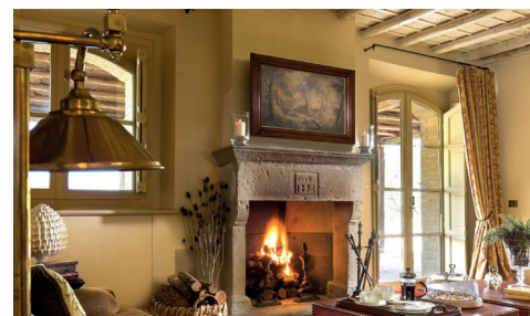
BEDROOMS: 3 SLEEPS: 6 Villa Alba at Rosewood Castiglion del Bosco, Tuscany