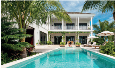
BEDROOMS: 5 SLEEPS: 10 Lara Waters, Turks & Caicos