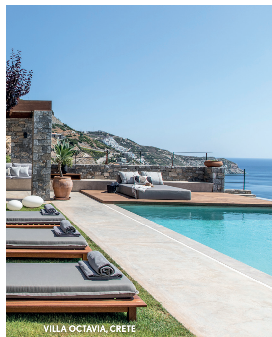
VILLA OCTAVIA, CRETE